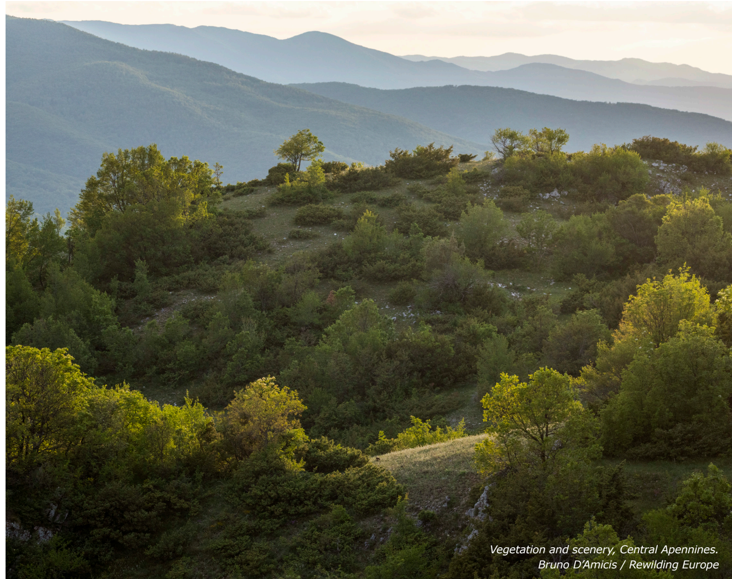
Vegetation and scenery, Central Apennines.

Private individuals or legal entities can propose that the Government or the Region creates a national park or other protected area. However, the actual creation of any such protected area will be via a legal instrument. To be effective, a proposal must be signed by 50,000 citizens (for national laws) and generally by 5,000-10,000 citizens (for regional laws; specific indications are set out in each regional law, depending on the specific regional population).