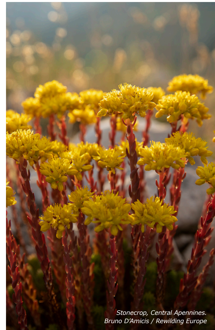
Stonecrop, Central Apennines.

To ensure the validity of the agreement, it must be executed in written form and registered within the competent Land Register for its enforcement vis-à-vis third parties. 17