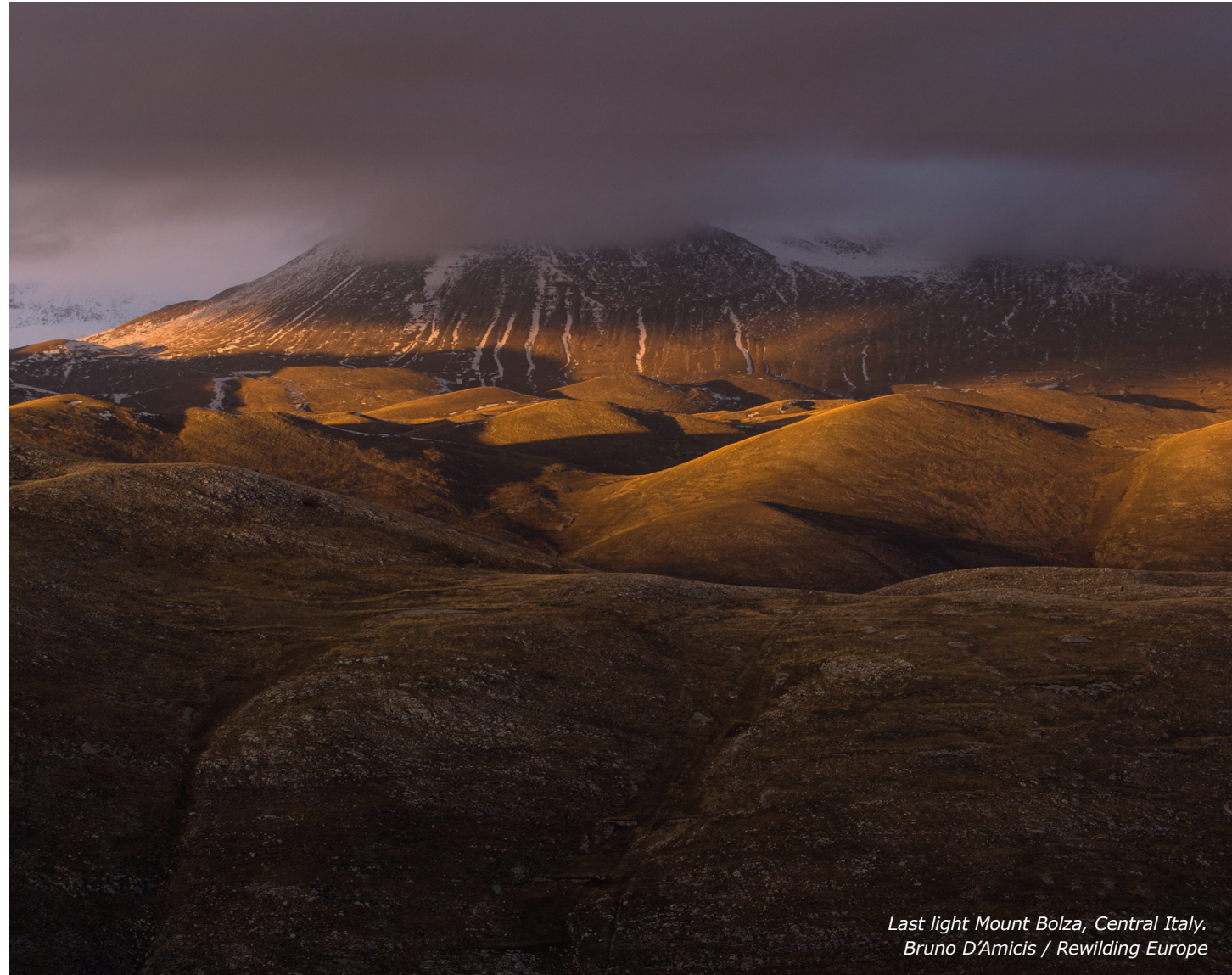
Last light Mount Bolza, Central Italy.

This principle may ensure further constitutional protection for rewilding purposes, although constitutional provisions do not produce immediate effects on the legal system, but rather establish a set of values that represent the ground on which the legal system is based.