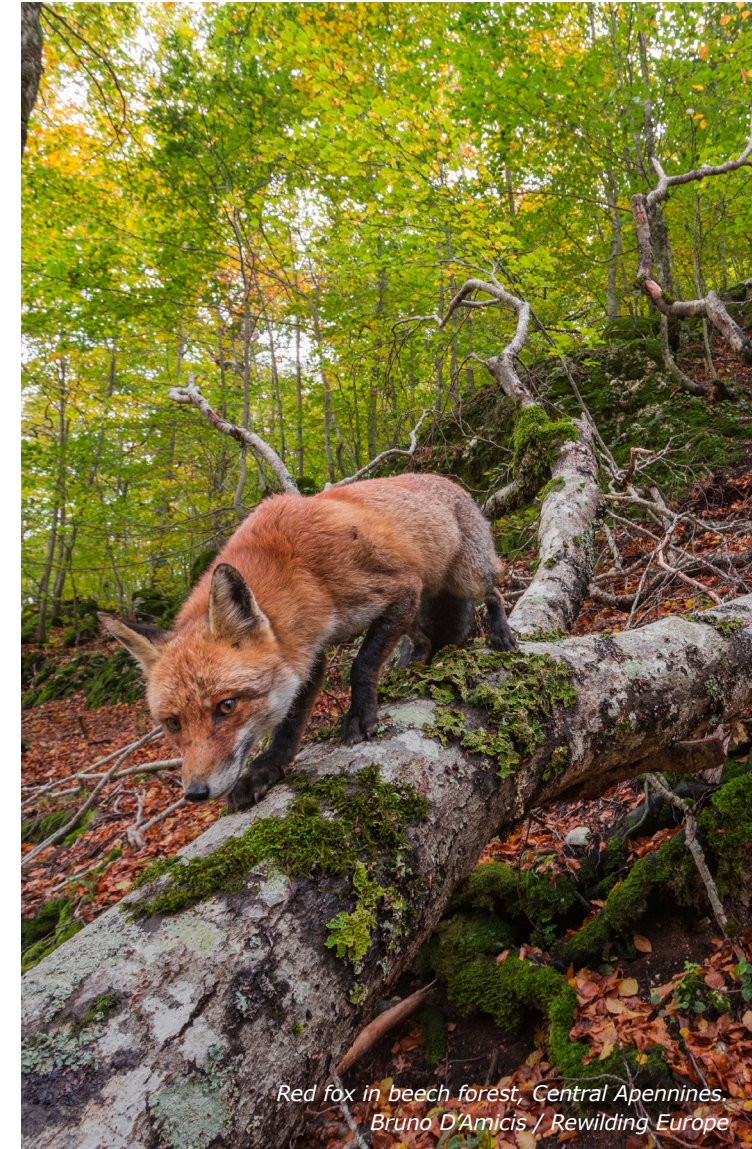
Red fox in beech forest, Central Apennines.

Conservation easements do not exist in Italy. However, if you take time to plan and think about this issue, there are certain legal structures that can be put in place to ensure longer term protection in Italy. The appropriateness and feasibility of each will depend on the specific facts in each case.